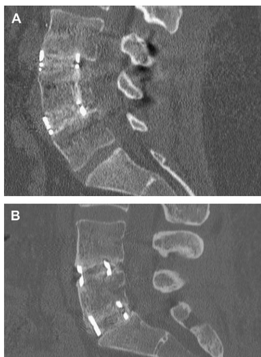
Fig. 1. Computed tomographic mid-sagittal reconstructed images of patient at 6 months after anterior/posterior fusion at L3–L4 and L4–L5 treated with titanium mesh cage and Autologous Growth Factors (AGF)–allograft bone (A); autograft (B) at L4–L5 and L5–S1 in the interbody space.

retroperitoneal approach that required repair, completion of the anterior procedure, and staging of the posterior surgery 5 days later. One symptomatic pseudarthrosis was noted in the AGF group, requiring revision posterior surgery.